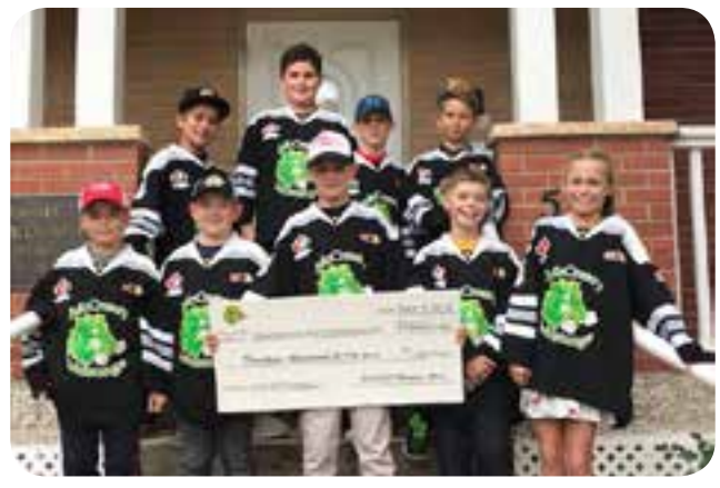
The McCreary Mustangs Atoms were filled with team spirit as they presented their incredible donation to RMHC Manitoba!

We invite you to sign-up your hockey team to raise funds for RMHC Manitoba and help keep families with sick or injured children close when they need it most. Show your team spirit by raising pledges for every goal your team scores during the 2018/2019 season. Every participating team will receive red and white striped hockey socks to show their stripes in support of RMHC Manitoba!