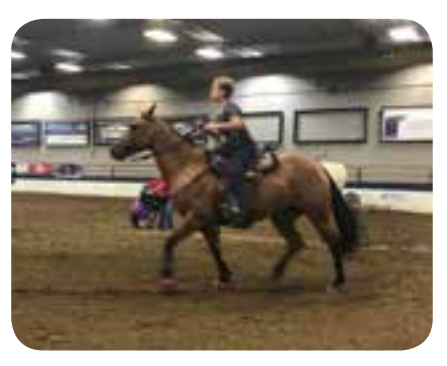
The annual Northern Lights Barrel Race raised $16,000 for RMHC Manitoba in 2018! Since 2012, over $94,000 has been raised by Northern Lights for our families!

RMHC Manitoba is fortunate to have an incredible community of advocates holding their own fundraising events in support of our cause! Thank you to all our friends who held events in 2018!